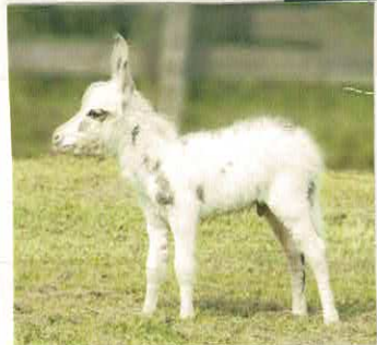
HHA Happy Hour 2.jpg

The American Donkey and Mule Society, PO Box 1210, Lewisville TX 75067 www.lovelongears.com/ (972) 219-0781 The American Donkey and Mule Society is not responsible for errors in information submitted to the registry.