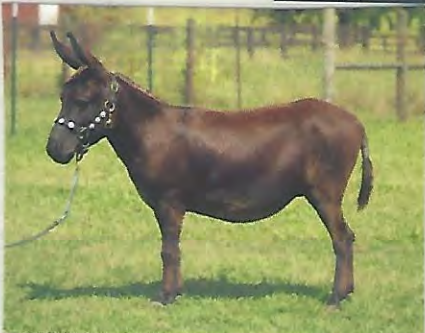
HHAA Paper Tyger 2.jpg